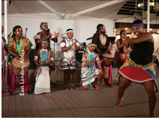
East London, Africa