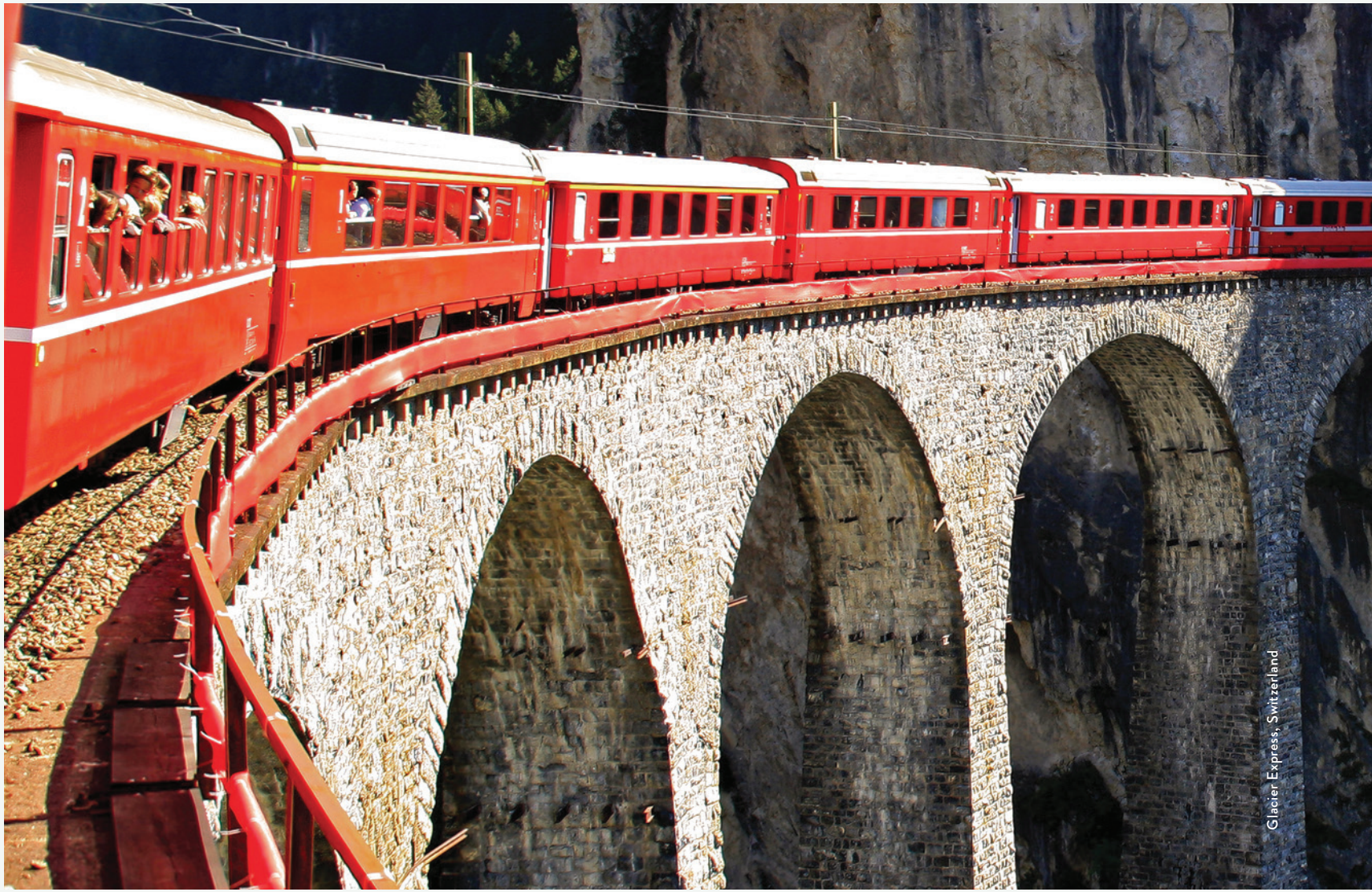
Glacier Express, Switzerland