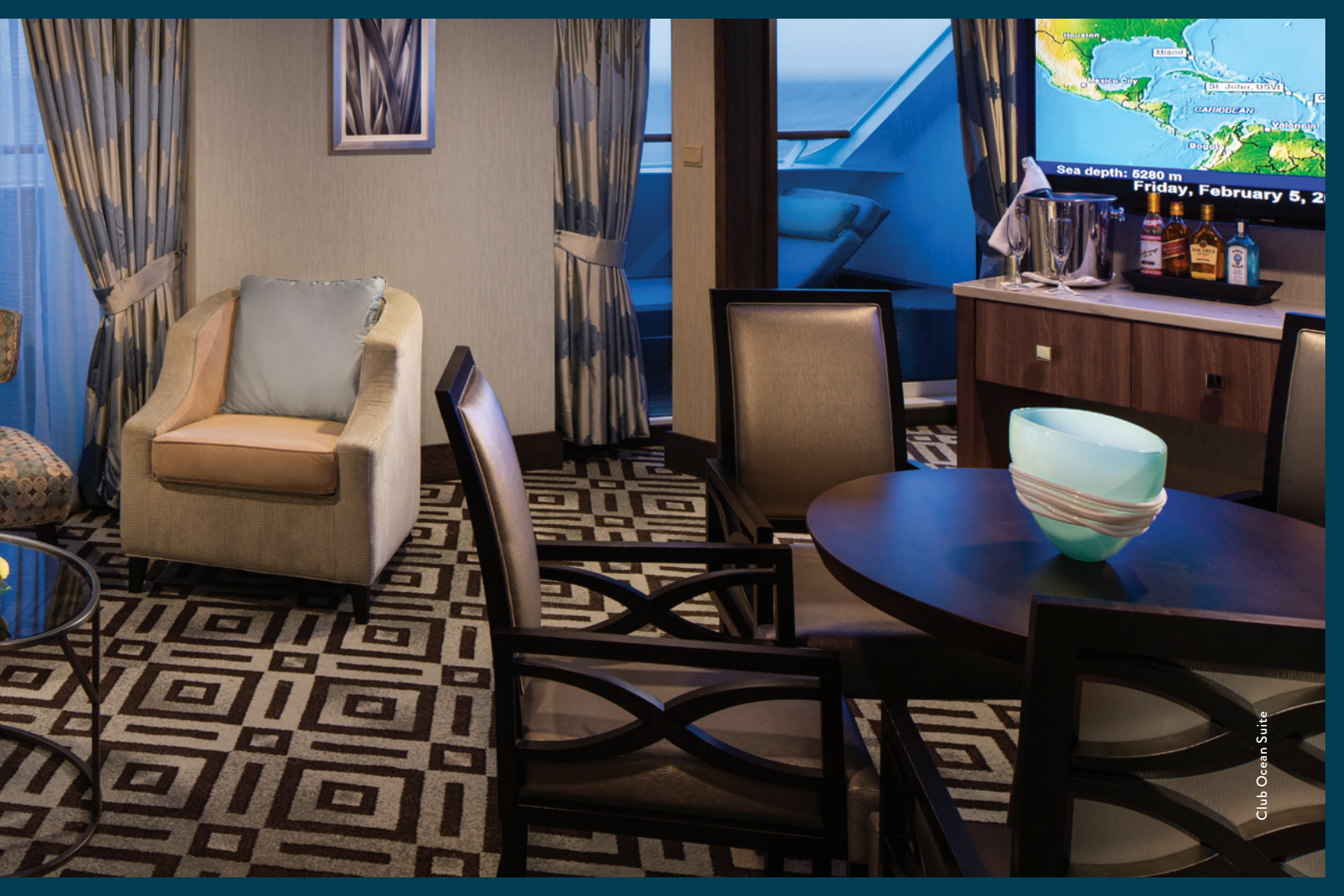
Club Ocean Suite