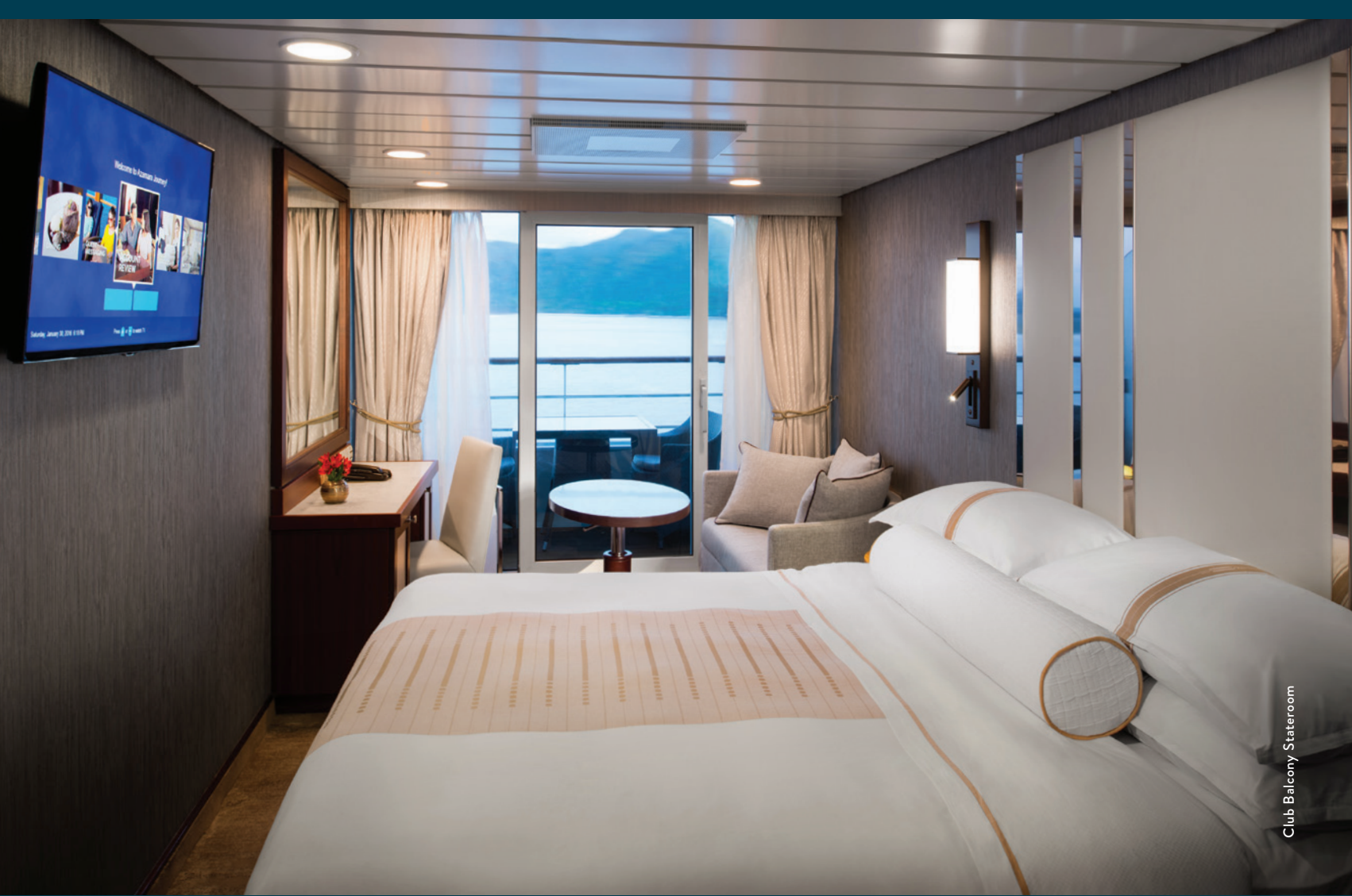
Club Balcony Stateroom